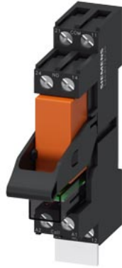
Plug-in relay complete unit 2 W, 230 V AC LED module red Standard plug-in socket screw terminal